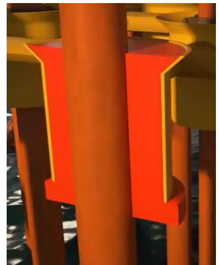
Figure 2: Cut Away View of Dorsal Centraliser